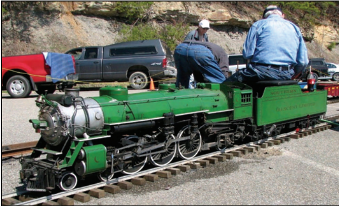
Southern Crescent Limited at Greenbo State Park