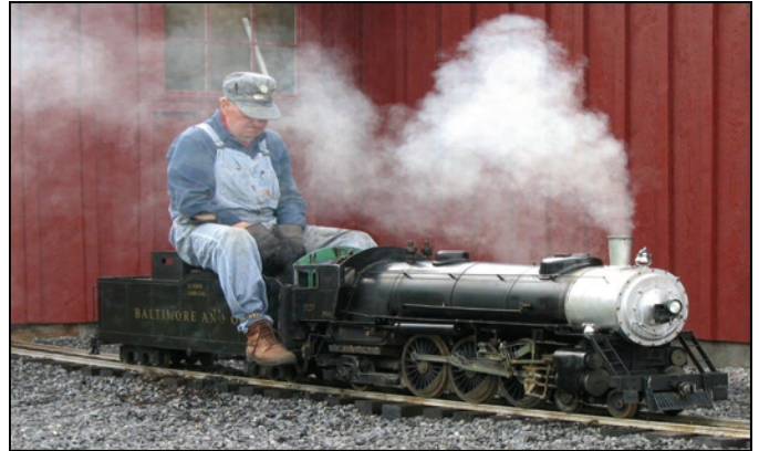
Baltimore & Ohio at Clifton Forge, Va.