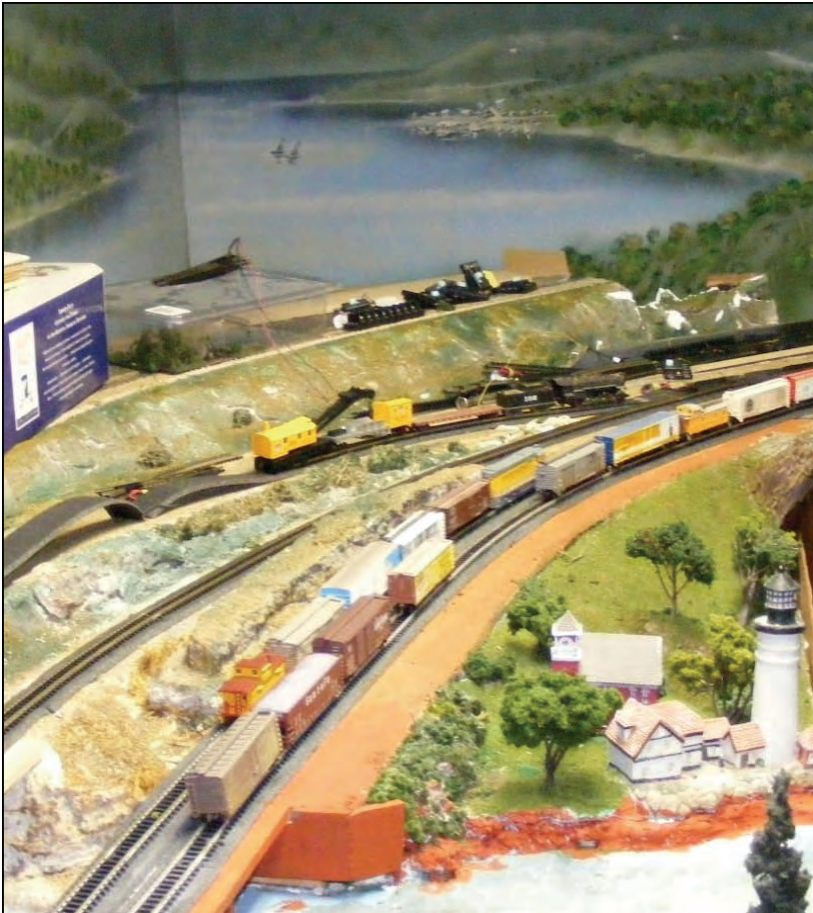
Rich Raspenti's N scale layout photographed on the May 3rd tour.