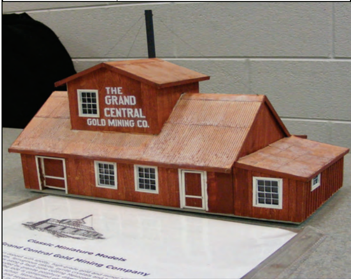
Tom Miller's Bring n' Brag winning Gold Mine building