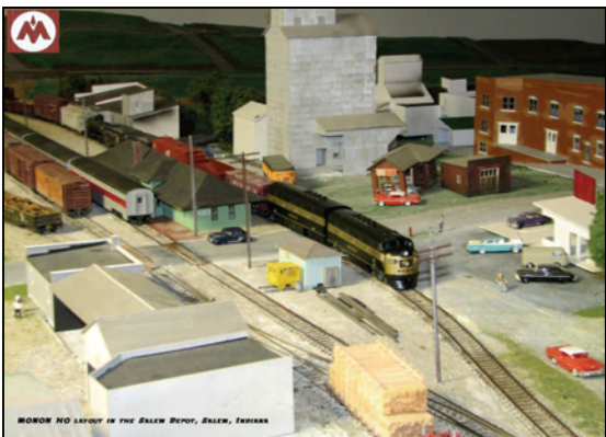
Salem Depot layout depicts the Monon in Washington Co. Indiana 1957-64 with 130 feet of mainline track. The buildings are scratch built replicas of the ones that existed in Salem, Pekin, & Campbellsburg. Four trains run on a single track in two directions.