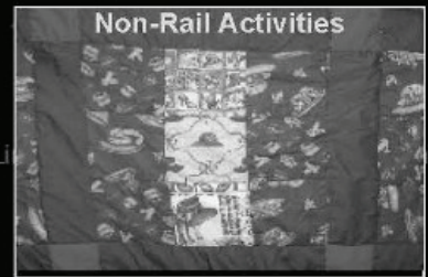
The 21st Century Limited