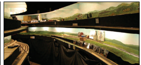
Two level layout on “S” shaped wall Photos and text by Stew Winstandley