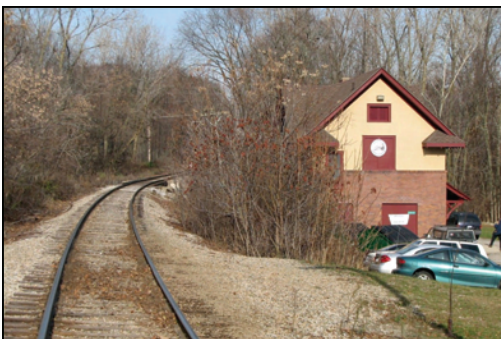
Club House next to Marquette Rail

This permanent HO layout is being built in a building that was used as a fish hatchery. Fingerlings were placed in milk cans and picked up by the Pere Marquette (line now operated by Marquette Rail) that passes within 30 feet of the building. They were dumped into waterways as the trains crossed these bodies of water. In 1995 construction began on the layout, with a 12 foot high stud wall shaped like an “S”. The wall is the mounting platform for cantilevered bench work on two levels on each side of the wall. The tracks on the two levels on each side run toward a helix at one end of the room. There is about 750 feet of mainline track, and 350 feet of branch line track. Scenery and building construction is still underway. During operations trains are controlled by the NCE DCC system and all train movement on the mainline will be regulated by a centralized traffic control system operated by a dispatcher in a separate room. The layout has over 25,000 feet of wire, 90 detector cards, 13 DCC boosters, 150 Tortoise switch machines, 50 manual turnouts, and three mother boards with 25 input/output cards. An article about the Pere Marquette’s 2-8-4 Berkshire 1225 was on pages 6 and 7 of last month’s Lantern . The NCR Division 4 web site’s address is http://www.gmrhs.org .