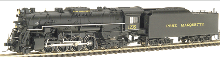
Walthers' Proto Heritage N scale 2-8-4

Copyright 2008 TRAINS Magazine. Reprinted with permission of Kalmbach Publishing Co. All rights reserved.