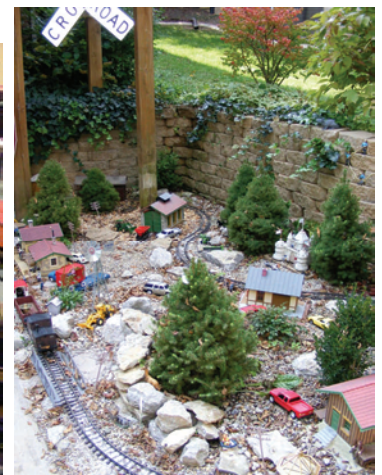
Above left: Howard's Lionel layout