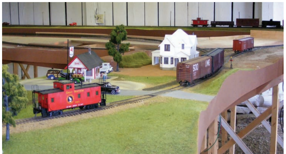
Grosser's new O-scale layout