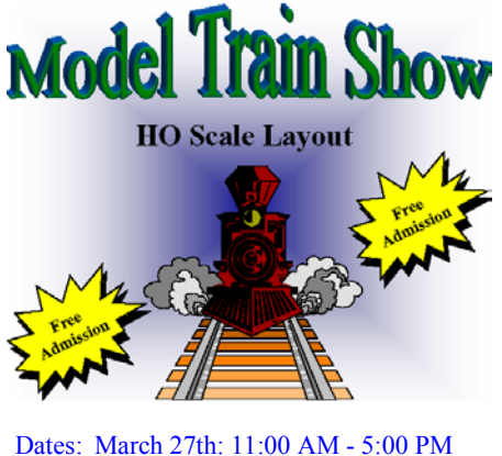
Dates: March 27th: 11:00 AM - 5:00 PM March 28th: 11:00 AM - 5:00 PM HO, N, and Lionel operating Train Displays

The Train Show will be in Louisville KY at 11700 Commonwealth Dr, in the Nova Building. Commonwealth Drive can be accessed from Blankenbaker Parkway. Turn right at the BP gas station. The Nova building is the third building on the left. Come by and see an operating HO scale layout.