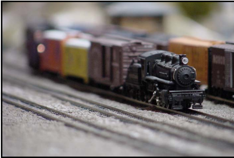
An 0-6-0 shuttles a short consist in the yard. ▲