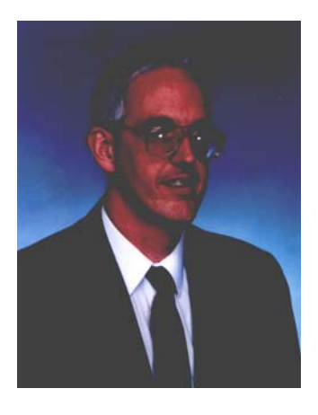
Who's That? (See Inside)