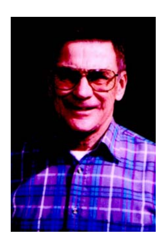
Who's That? (See Inside)