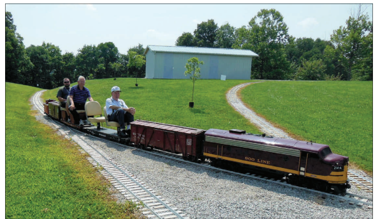
From our meeting at the Grosser's, top left and then clockwise, Hudson Valley being loaded into van from the transfer table, CN&W SW, the Grosser's Soo Line F7, and Heavenly Hilltop's steam. It was a great day for riding 7.5 inch gauge trains.