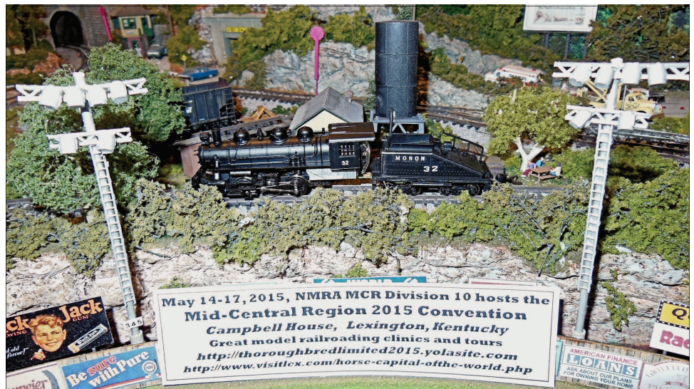
Above: Convention sign on the center field fence on Bob Ferguson's N scale layout