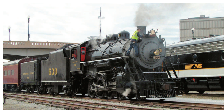
TVRM Southern 630 in Knoxville, Tenn.